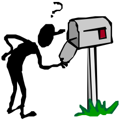
Have you updated your contact info lately?