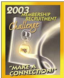
2003 New Member Campaign