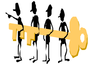
Active members hold the key to our Chapter's success...

As you've probably seen, a lot of "alliances" have been formed lately be-